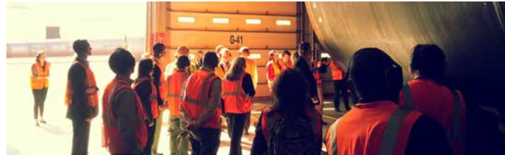
Delegates tour Vestas Wind Systems, Pueblo, Colorado.

The most valuable thing about Colorado Experience has been understanding the culture of the communities outside the metro area. My organization has been evaluating the possibility of expanding our footprint across the state. Because of my participation in Colorado Experience, I was able to reach out to community and business leaders to gain insight and hear their perspectives.