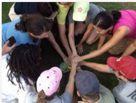
Team building during LD '14 Retreat at The Nature Place

Leadership Denver (LD) equips leaders with knowledge of important regional issues and new connections that can be instrumental in creating a vibrant community. This year Leadership Denver celebrated 40 years of promoting meaningful civic engagement and fostering a sense of community among Denver's leaders from the private, public and nonprofit sectors.