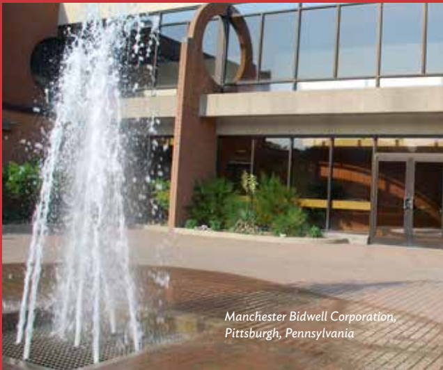
Manchester Bidwell Corporation, Pittsburgh, Pennsylvania