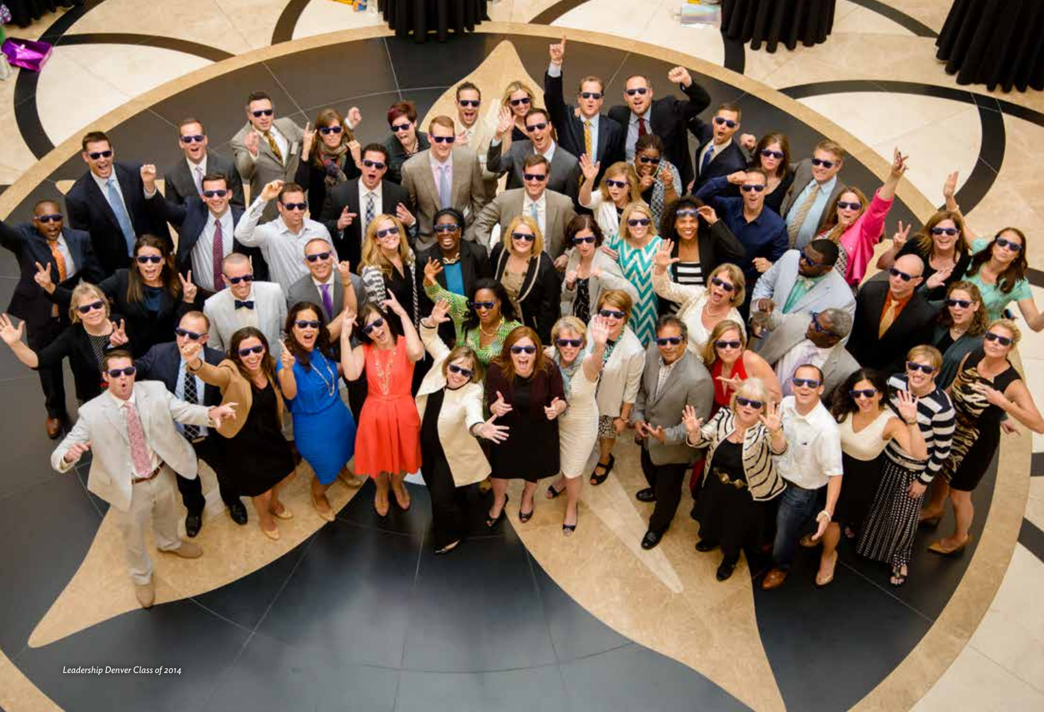
Leadership Denver Class of 2014