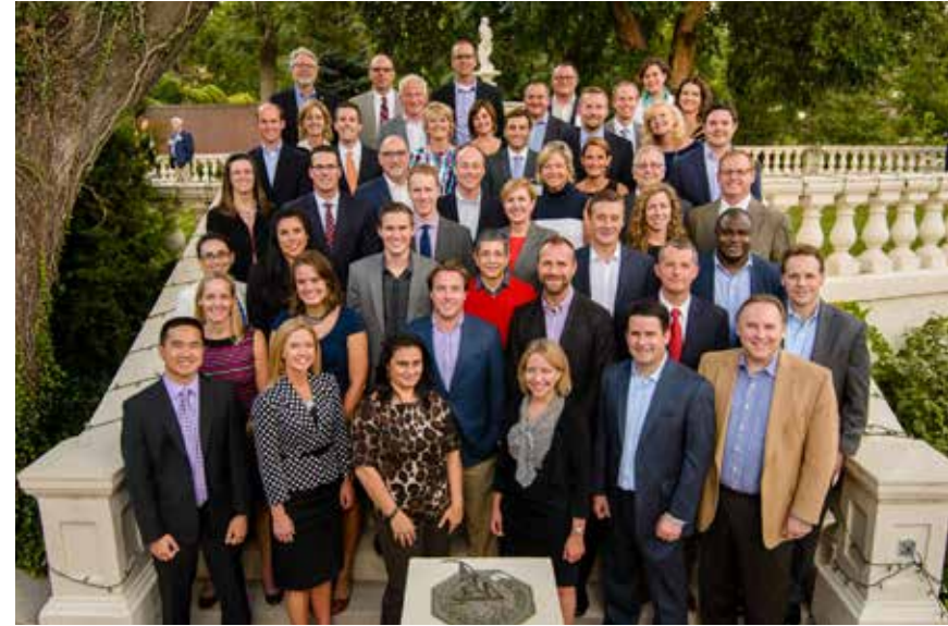
Access Denver Class of 2014

"The most valuable aspect of Access Denver is networking with like-minded people and hearing an overview of the most pressing issues facing Denver."