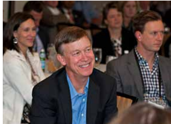
John W. Hickenlooper, Governor, State of Colorado