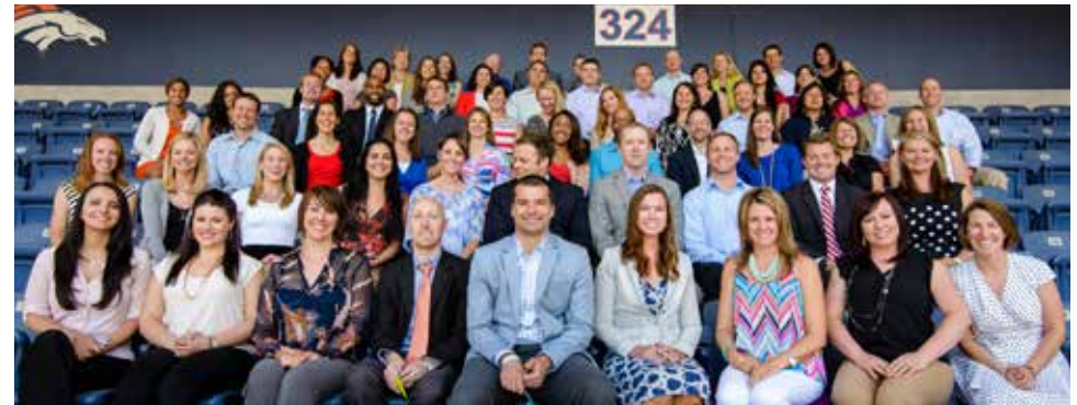
Impact Denver Class of 2014